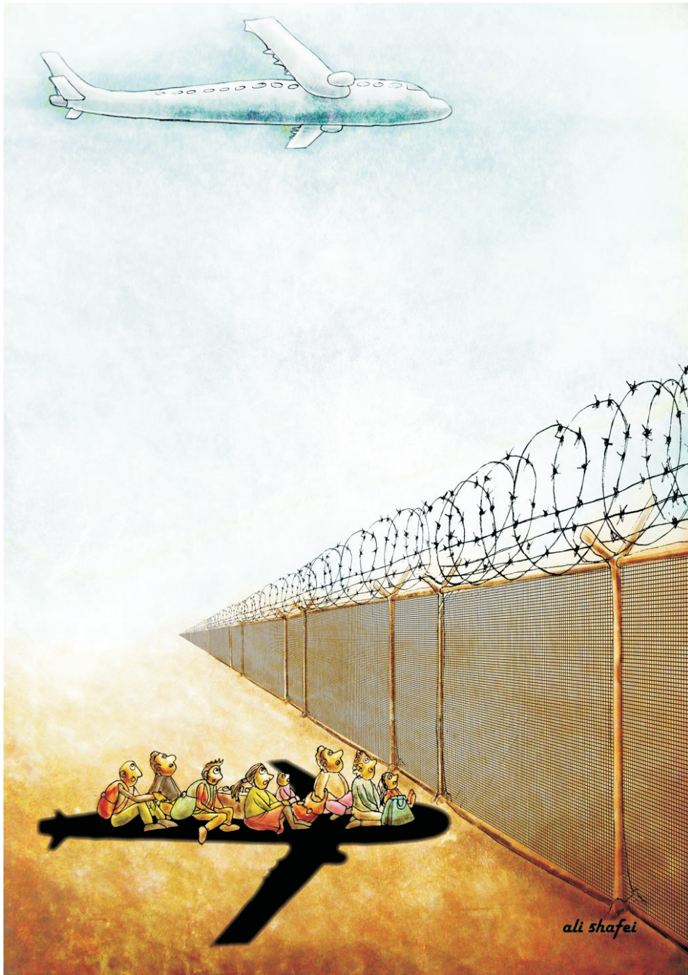
8th International Tourism Cartoon Competition (Theme: Future of Tourism, Tourism of the Future )